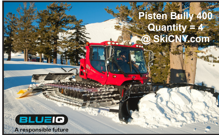
Piston Bully 400 Quantity = 4 @ SkiCNY.com